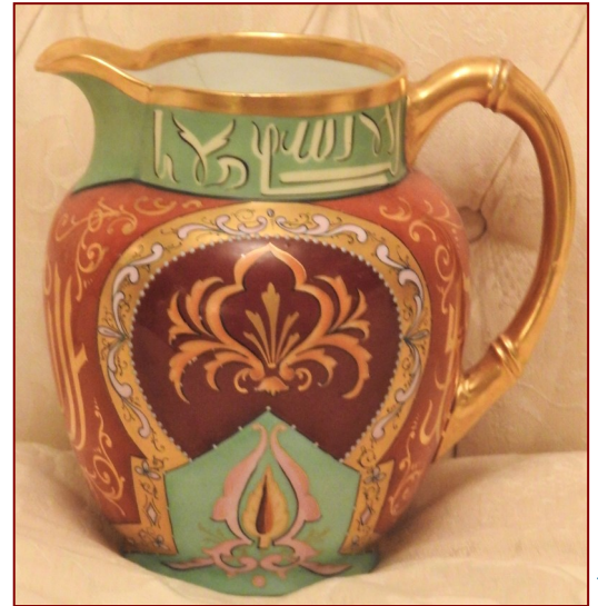
Arabian Pattern, Pickard 1905-10