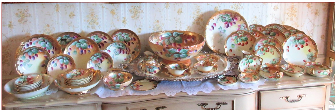
Yeschek Raspberries from the Poulos collection.