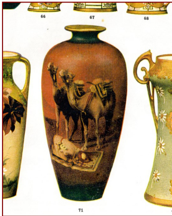
Praying Mohammedan Advertisement