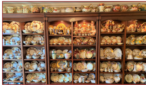
The Poulos Great Wall of China.