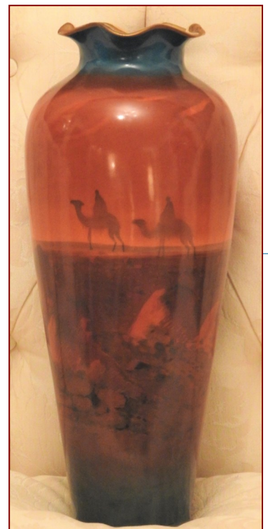
Breidel, Pickard, 1905-10