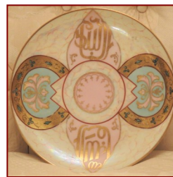
1905-10 Arabian by Lindner

Of course, Pickard's figural also addressed this theme, epitomized by the "Praying Mohammedan" pattern. The pattern depicts a Muslim on a prayer rug facing Mecca near two camels, sometimes with pyramids in the background, and were usually painted by Breidel, Weiss, or Farrington. This was advertised in old literature, and an example appears at Plate 52 in the Collectors Encyclopedia of Pickard China by Alan Reed.