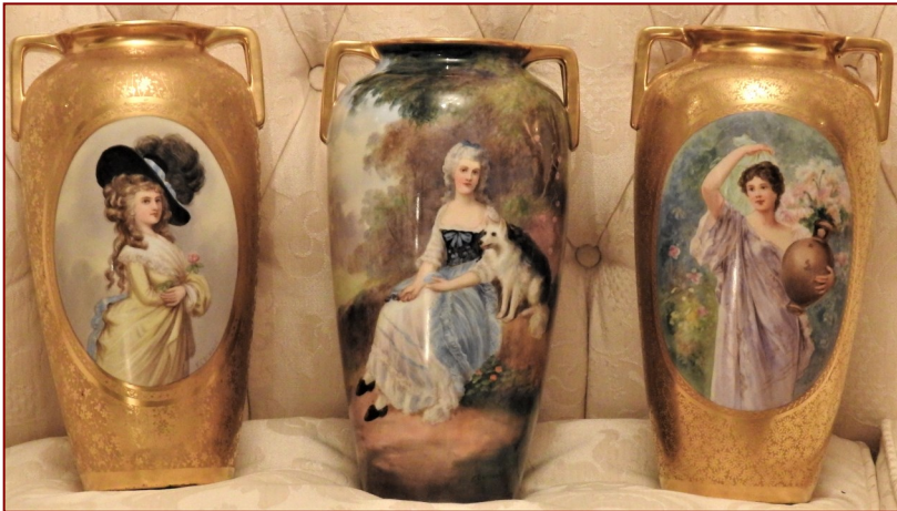
Examples, Lewis Vase