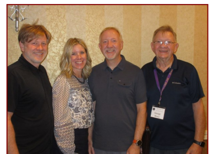
The Bruce Family